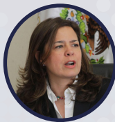
Hon. Marcela Celorio Consul General Consulate General of Mexico in Los Angeles