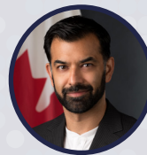
Hon. Zaib Shaikh Consul General Consulate General of Canada in Los Angeles